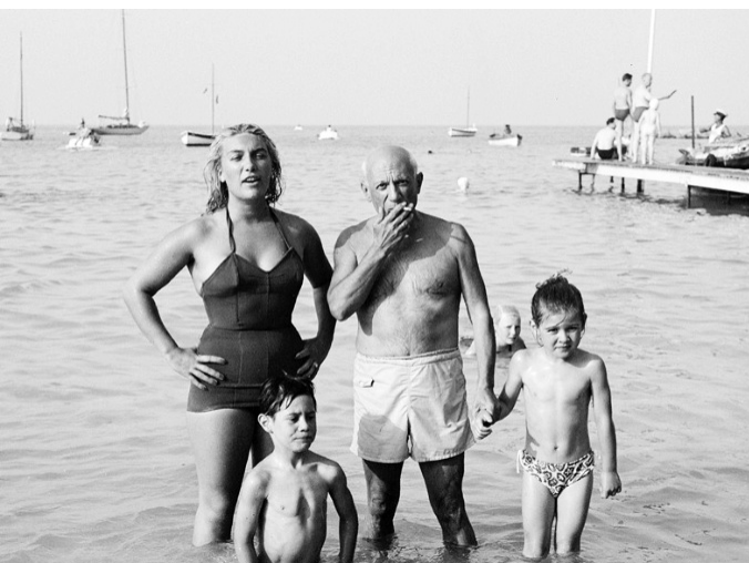
Picasso with his children Claude, Paloma, and Maya at the beach Golfe Juan, Antibes - Cannes, 1954