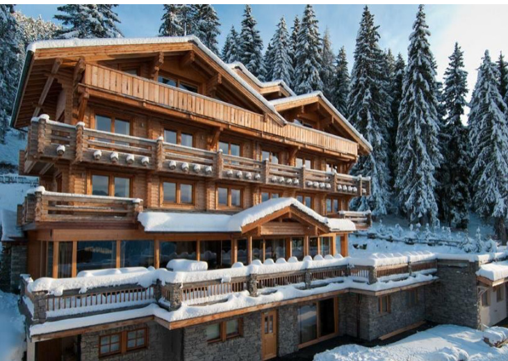
The Lodge, Sir Richard Branson's luxury ski chalet in Verbier, perched high in the Swiss Alps, it gives its guests a chance to meet and greet with the Virgin's creator himself. Publicity photo.