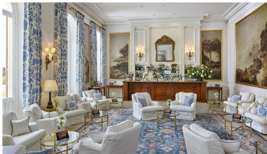
Bellini Bar where in 1948 Bellini, the famous cocktail made out of champagne and peach was created. Publicity photo.